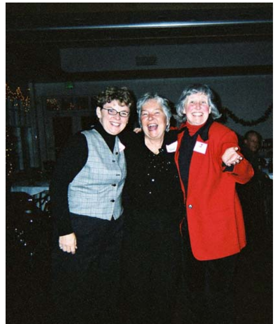
Having fun at the Winter Lavender Gala December 2004

As the year progresses more activities selected by you from the survey will be spotlighted at Rainbow Elder meetings. Thanks to those of you who participated in the survey!