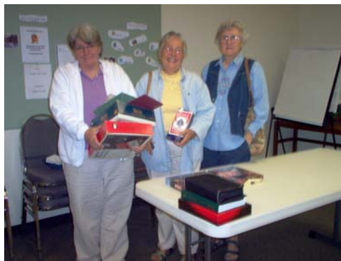
Volunteers packing up after the Card and Game Night that the Rainbow Elders sponsored for the 2006 Boulder Pride Fest.

The Rainbow Elder annual summer picnic will be the next big event on the horizon. This years picnic will be held August 15 on Flagstaff MTN. and begins with hiking, games and conversation at 1:00 PM. The potluck picnic will begin at 4:00 PM. Bring an appetizer, salad, or