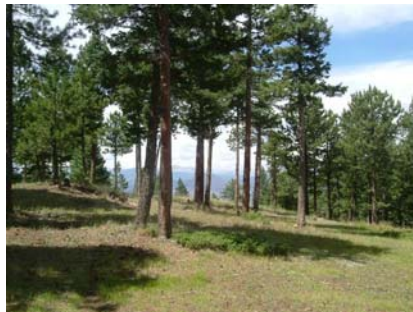
Flagstaff venue for August Rainbow Elders picnic.