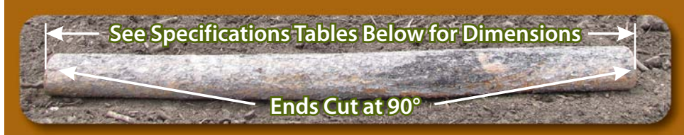
This is an example of what a finished log should look like.