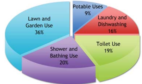
Typical household water use:

Boulder County's growing population puts pressure on water resources and can endanger water quality. Major impacts from residential construction and home use include degradation of water quality from surface runoff and wastewater generation. Research indicates that a typical household wastes between 8,000 and 10,000 gallons of water a year while waiting for hot water to arrive at the tap.