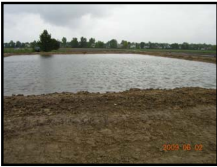
Irrigation Pond on James Construction