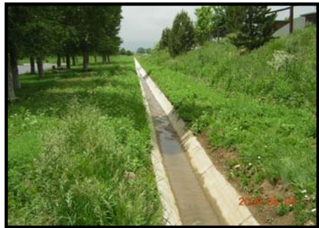
Concrete Lined Ditch for Monarch