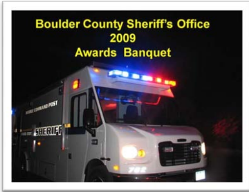
Figure 5 - Awards Banquet

Each year the Boulder County Sheriff's Office hosts an Annual Awards Banquet and Ceremony. It is at this event that employees, members of the community, and a number of volunteers are honored for their service or action that resulted in a positive outcome or enhanced the effectiveness of the Boulder County Sheriff's Office. This event is a special evening for employees and their families and attendance ranges between 200-250 people.